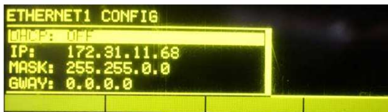
Ethernet 1 port configuration screen